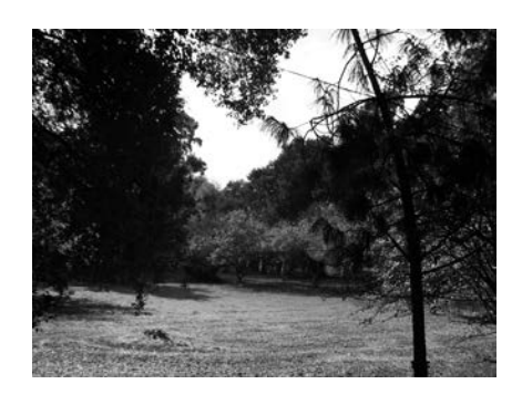
Incorporate trails, greenways, and linear recreation facilities as integral concepts of new development.