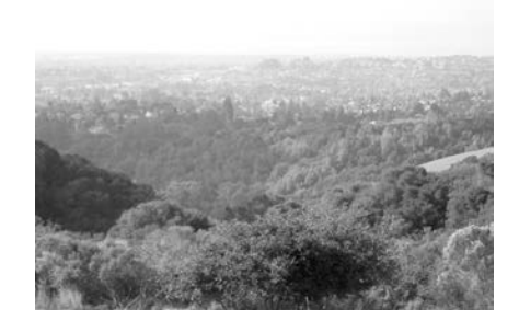
Castro Valley adjoins more than 5,500 acres of regional parkland, which helps to make up for a shortage of neighborhood and community parks.

Regional parks can range from several hundred to several thousand acres in size and typically serve surrounding communities in the vicinity of the regional park as well as drawing people from farther afield. Regional parks in the Castro Valley area provide lakes for swimming, fishing and small craft boating; picnic areas; camping; bicycling; horseback riding; and hiking. Because they include the kind of active recreation facilities that are typically found in community parks and are located within walking distance or a short drive from residential neighborhoods, Cull Canyon and Don Castro Recreation Areas function like community parks for many Castro Valley residents. Table 8.2-5 describes the more than 5,500 acres of regional parkland in the vicinity of Castro Valley.