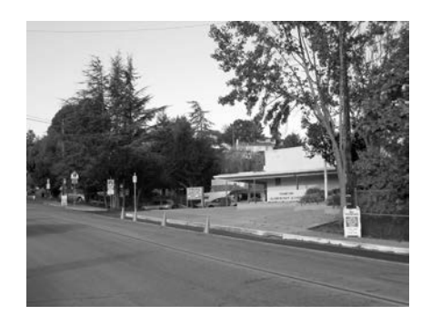
Stanton Elementary School