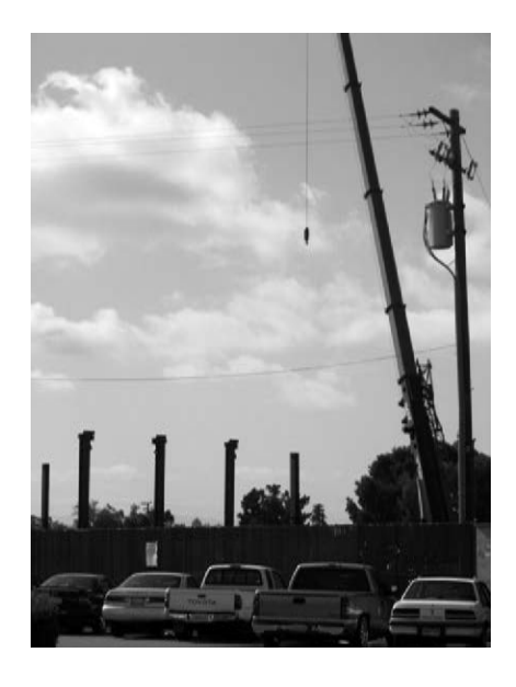
Performing Arts Center at Castro Valley High School under construction. School facilities such as this play a critical role in providing community facilities and defining Castro Valley's identity.