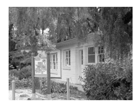
Adobe Art Center. Work with public agencies to identify the program and service needs of all segments of the community.