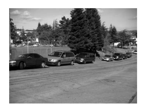
Stanton Elementary Playing Field. Ensure that local or school parks are available within a 10 to 15 minute walking distance of the population the park is intended to serve.