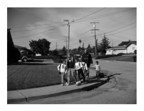
Promote easy access by foot, bicycle, and public transit to community and neighborhood service facilities.