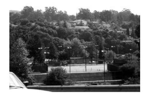
The tennis court at Bay Trees Park is heavilyused by the community.