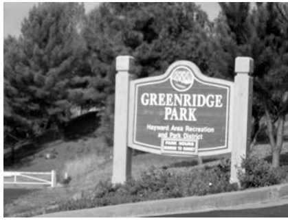
Greenridge Park, a neighborhood park in Castro Valley. Access to local parks and regional parks makes the community a desirable place to live.

The quality of local schools has become one of the major factors influencing decisions about residential location in the San Francisco Bay area and much of California. Access to attractive parks and other recreation facilities and cultural amenities such as libraries also make a community a desirable place to live. Neighborhood and community parks are especially valued in Castro Valley because the existing acreage of local parks is relatively small in proportion to the number of residents. This part of the plan provides policies and proposals for these and other community services, such as childcare, that will significantly affect the quality of life enjoyed by those who live and work in the planning area. In addition to planning for community services to meet the needs of present and future residents of all ages and income levels, these proposals seek to ensure that the community facilities and services the community desires will have the capacity to serve new development under the General Plan without degrading existing service levels.