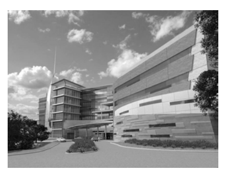
The existing hospital building (top picture) will be demolished following completion of the new Eden Medical Center Castro Valley Facility.