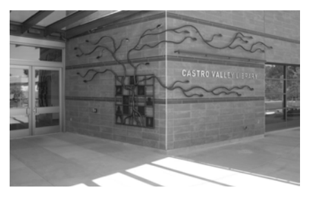
Castro Valley Library.