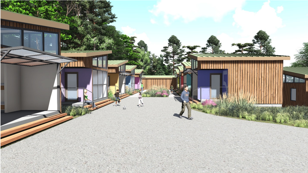
View Looking North – Cabins