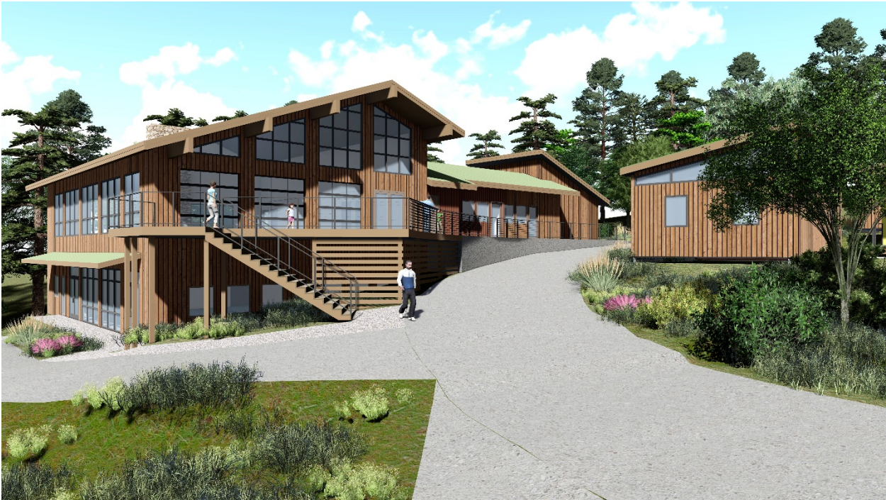
View Looking Southwest – Multi-Use Building

All buildings on-site will be designed with a rustic mountain vernacular that includes stone, lap siding, and board and batten siding in materials that meet WUI standards. Buildings are sited to maximize natural lighting, use high-performance glazing, incorporate passive heating and cooling strategies, and employ low-flow fixtures, all to minimize energy consumption and to exceed Title 24 requirements.