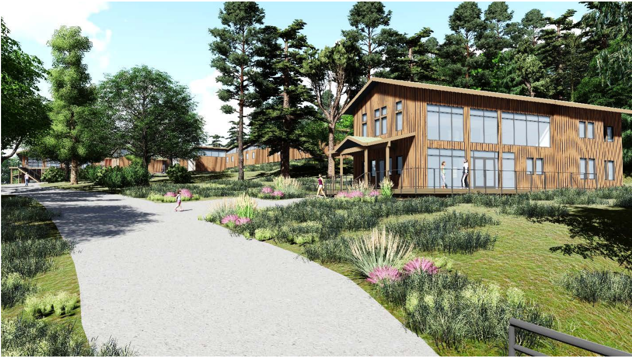
View Looking South – Staff House