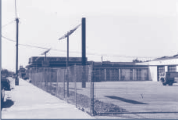
One of our projects before renovation. See inside photo for new look!