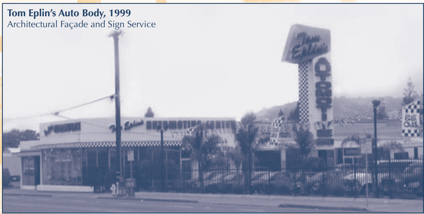
Tom Eplin's Auto Body, 1999 Architectural Façade and Sign Service