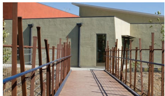
Castro Valley Branch, Alameda County Library