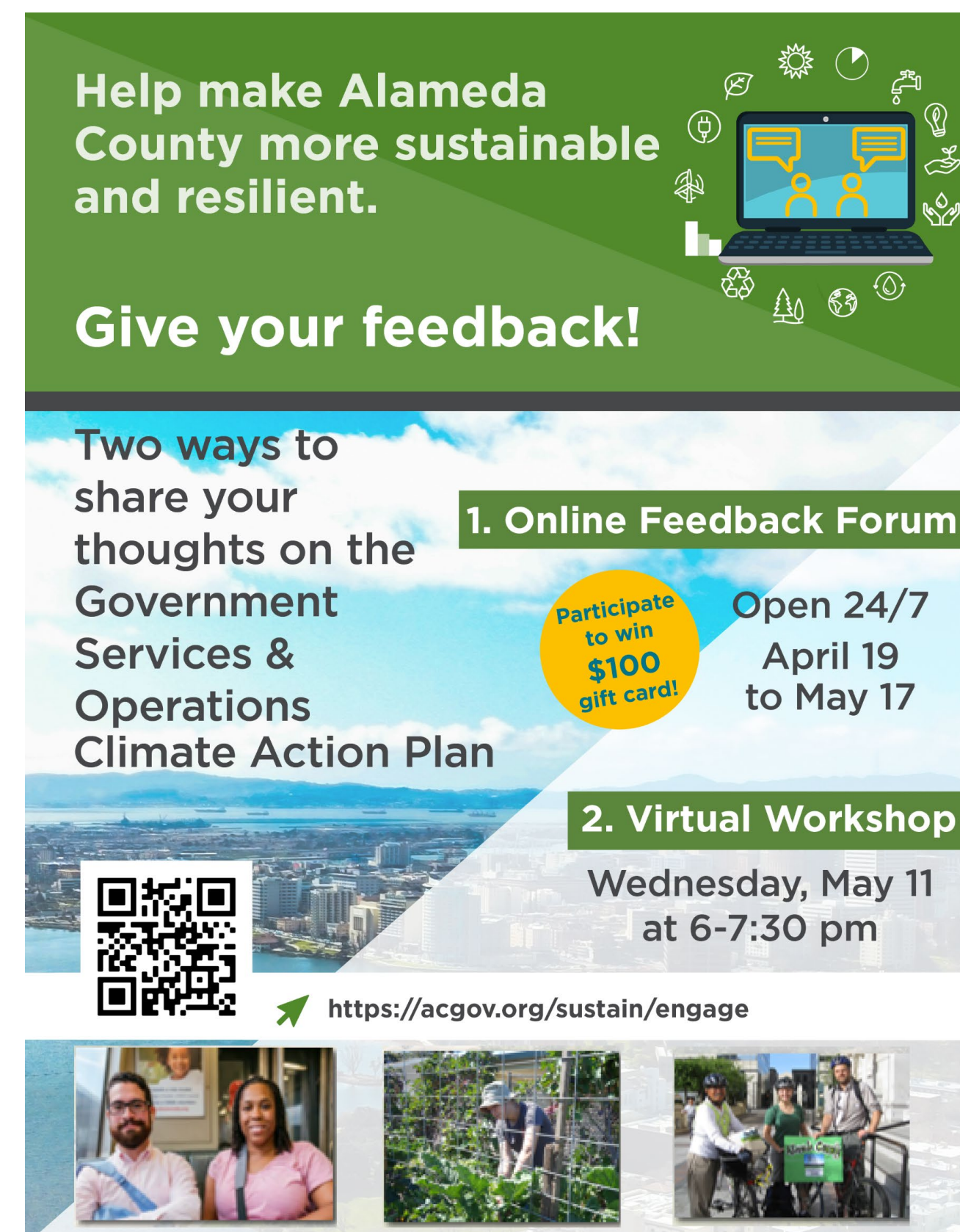
The engagement flyer for the second round of community feedback was translated into 3 languages.

Along with contributing to the development of the plan's structure and framework as a GOCAP team member, I helped develop the 12 actions and 30 sub-actions for one of the six plan sections. This section includes overarching measures related to advocacy, employee safety, finance, and plan implementation that create an equitable foundation for climate action to address the needs of the Alameda County community.