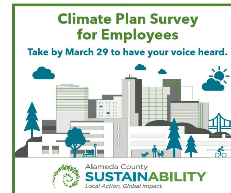
My intranet ad encouraged employee survey participation.

We gained valuable input through three climate plan surveys. I analyzed results from the commute and employee surveys, and the public survey I promoted received over 1200 responses.