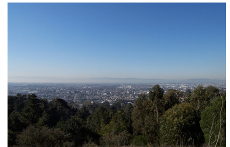
View of the Eden Area

Growth should be managed to bring in needed benefits while preserving the important qualities of the Eden Area. New development should be pedestrian- and transit-oriented; properties and streets should be repaired and enhanced. New projects should pay their fair share of the costs to create and maintain the quality of life desired for the Eden Area. All stakeholders will continue to have the opportunity to participate in the land use decision-making process to balance community needs and values with the rights of individuals. Additionally, the Eden Area will provide expanded employment opportunities for its residents.