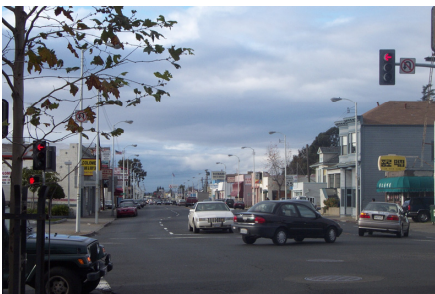
Commercial street in the Eden Area