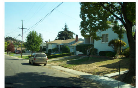
Residential street in the Eden Area