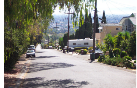
Residential street in Ashland