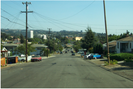
Residential street in Cherryland

The Eden Area is a part of a greater regional community, and will have to work with its neighbors to seek solutions to the wider issues that cross its borders. Eden Area residents are proud of their community and welcome the opportunity to be in control of their destiny. The vision for the Eden Area is to ensure that residents will live in a dynamic, aesthetically pleasing and livable community for many generations to come.