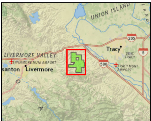
Figure 1 Revised 19 Turbine Layout Mulqueeney Ranch Wind Repowering Project