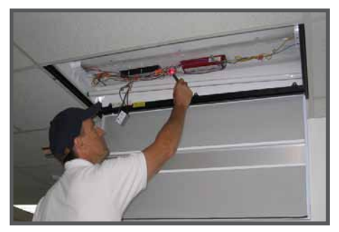
Alameda County's lighting retrofit is expected to save $350,000 per year.

Water: 77 million gallons Taxpayer Dollars: $405,000