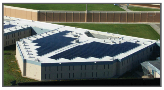
EPA recognized Alameda County for on-site solar power, including this 1.18 megawatt installation at Santa Rita Jail.