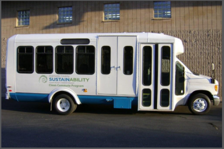
Providing shuttles to reduce emissions.