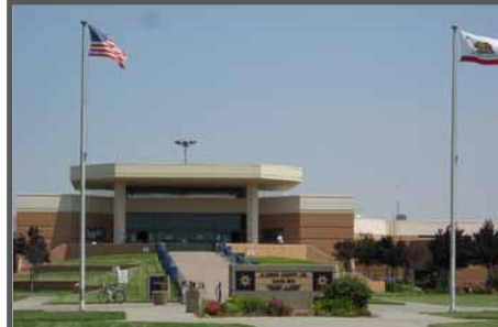
Energy and water efficiency are a priority at the 24/7 Santa Rita Jail.