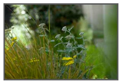
Water-wise landscaping with droughttolerant plants conserves water.