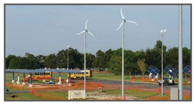
The Santa Rita Jail Smart Grid includes small wind turbines, advanced battery energy storage, and solar hot water.