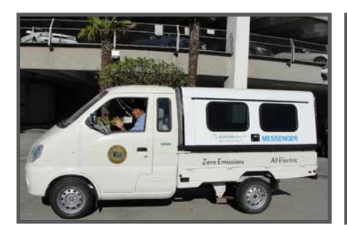
Choosing electric vehicles.

Leadership through partnerships: Participate in the East Bay Clean Cities Coalition; organized the Alameda County and cities sustainable transportation working group; and partner with multiple local governments to build the Bay Area Electric Vehicle Corridor.