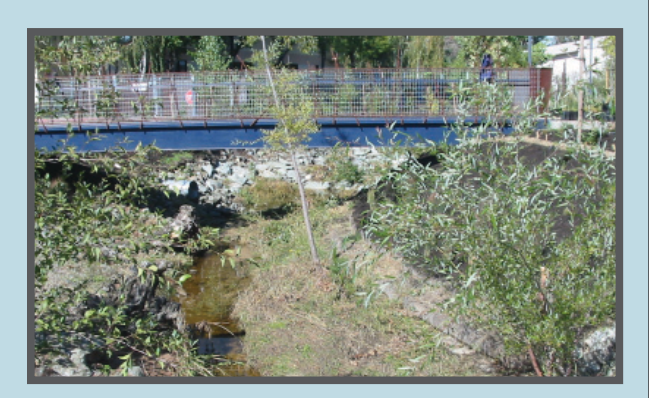
Pedestrian bridge over newly restored Castro Valley Creek.